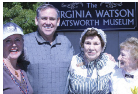
The Virginia Watson Chatsworth Museum